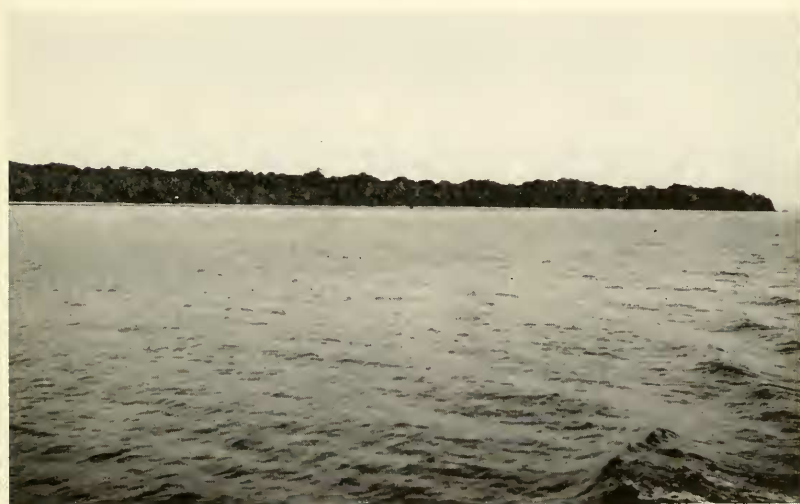
2. Southern shore of eastern end of Isla Escudo de Veraguas.